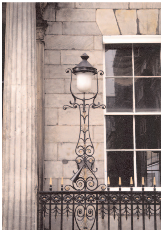
Chandos House, London (detail)

Meet at Tower Hill Station at 09:30. After a visit to St Katharine Docks, the coach will depart from Tower Hill at 10:00 returning in the afternoon to King's Cross Station and the Paul Mellon Centre by 17:30.