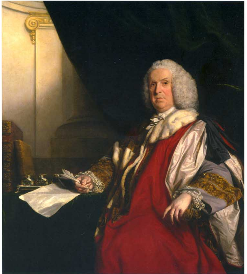
Sir Joshua Reynolds, William Pulteney, 1st Earl of Bath (1761), National Portrait

The conference, which also draws on the strengths of the University of York's History of Art Department, will reflect upon the art-historical legacy of the early 1990s, when a number of important books were published on the subject of Georgian portraiture, and explore the approaches to the