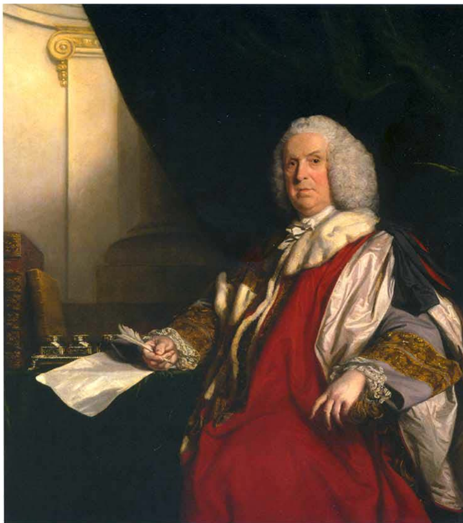
Sir Joshua Reynolds, William Pulteney, 1st Earl of Bath (1761), National Portrait

The conference, which also draws on the strengths of the University of York's History of Art Department, will reflect upon the art-historical legacy of the early 1990s, when a number of important books were published on the subject of Georgian portraiture, and explore the approaches to the